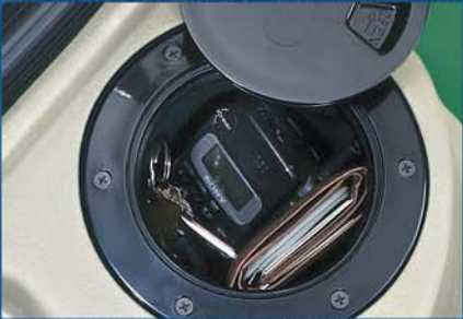
Dry storage holds wallets, sunglasses, jewelry, cell phones, cameras, etc.