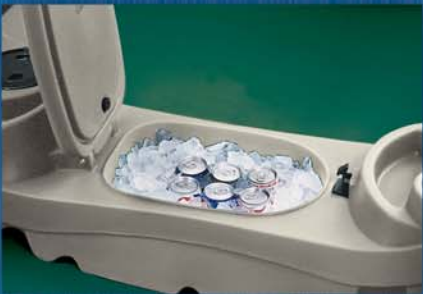
Built-in cooler located under center seat